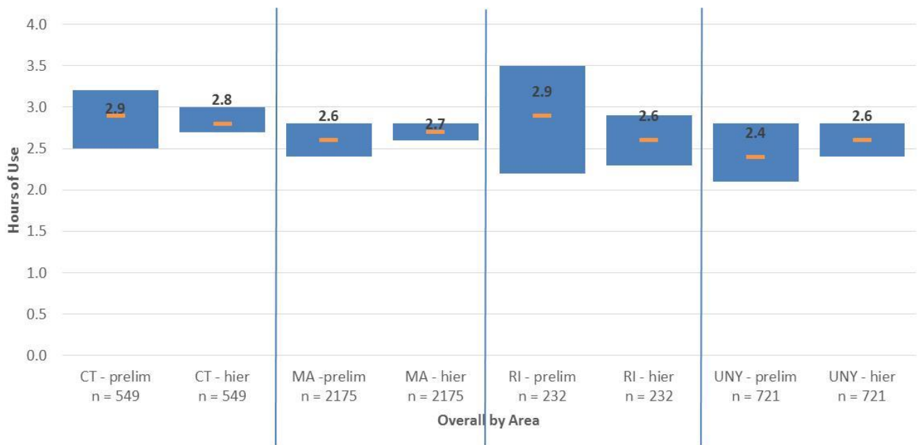
Figure 3. Comparison of Preliminary and Hierarchical HOU Estimates and Confidence Intervals